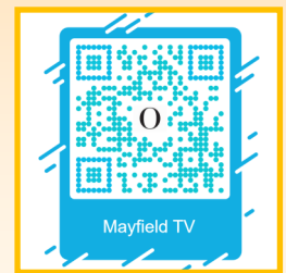
YOUTUBE CHANNEL, OPEN MAYFIELD'S COOL FACEBOOK & X