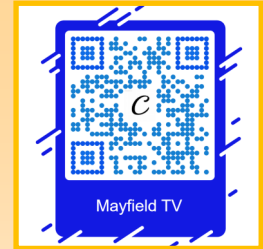
CLOSED FACEBOOK PAGE