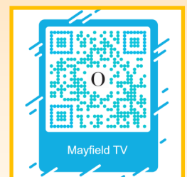
YOUTUBE CHANNEL, OPEN MAYFIELD'S COOL FACEBOOK & X